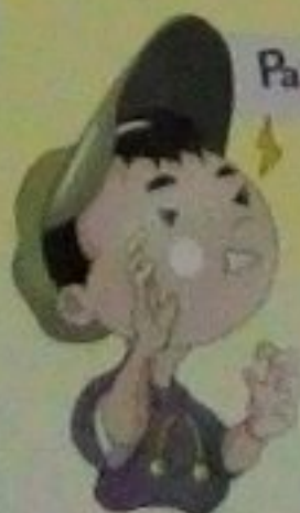
Pananakit ng mata