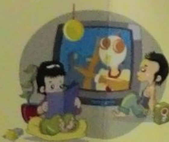
Napakalapit magbasa o magsulat at manood ng telebisyon