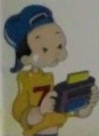
Malimit o di-mapigilang pagkurap