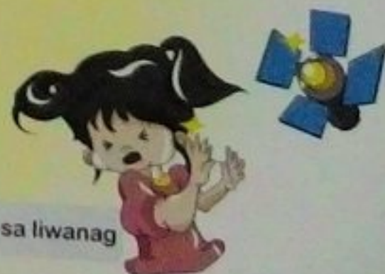
Madaling masilaw sa liwanag