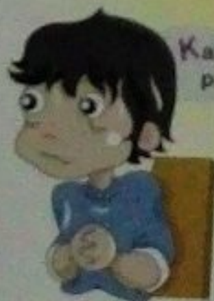
Kakaibang paglaki o pagluwa ng mata