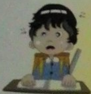
Kakaibang galaw o direksiyon ng paggalaw ng mata