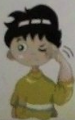
Fangangati ng mata