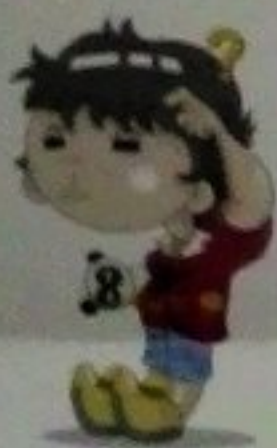
Paniliit ng mata para luminaw ang paningin sa malayo