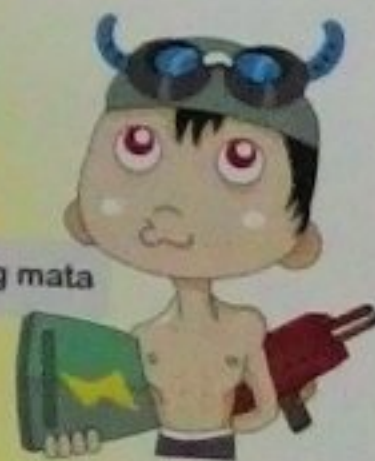
Pamumula ng mata