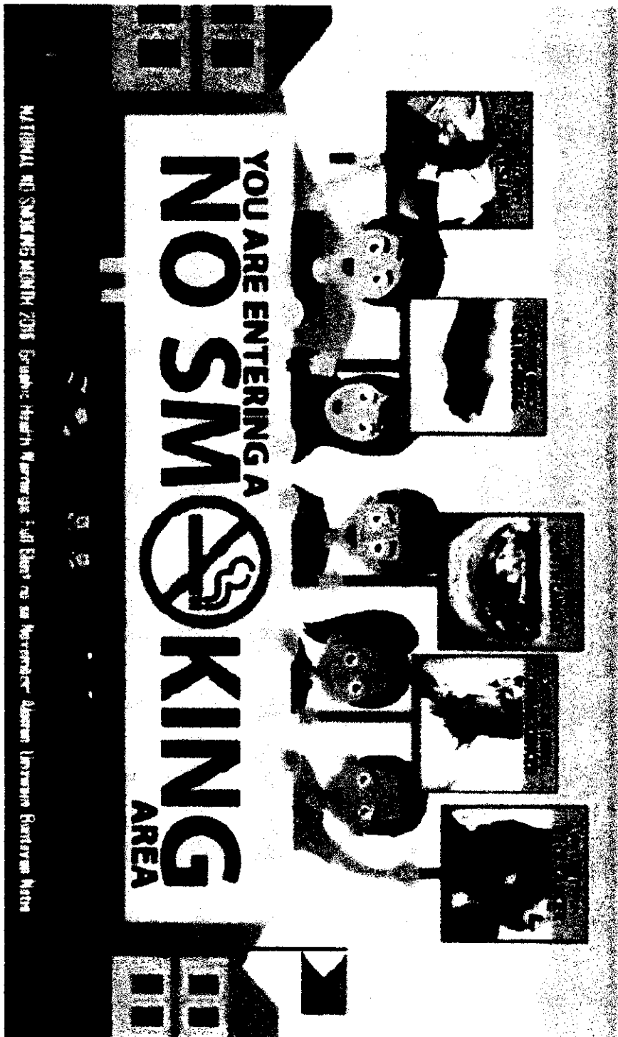
Sample of the You Are Entering a No Smoking Area Sign (3 ft x 5 ft)