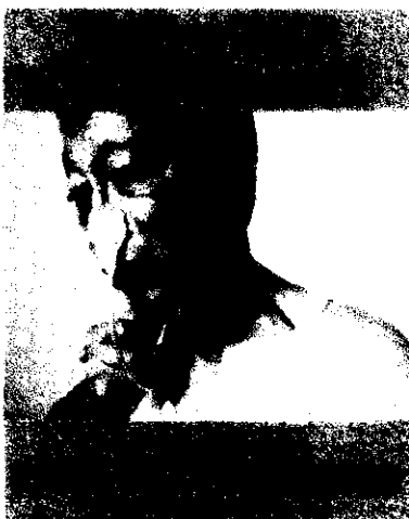
DepED NO SMOKING MONTH 2016 DepEd Health Campaign, P.O. Box No. 24, Pasig City DepEd - Division Office - Pasig City