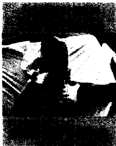
DepED NO SMOKING MONTH 2016 DepEd Health Campaign, P.O. Box No. 24, Pasig City DepEd - Division Office - Pasig City