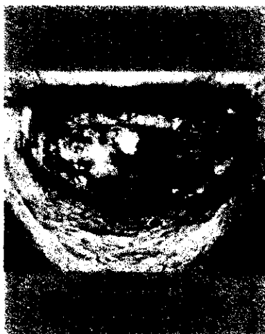
DepED NO SMOKING MONTH 2016 DepEd Health Campaign, P.O. Box No. 24, Pasig City DepEd - Division Office - Pasig City