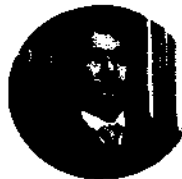
CHIEF JUSTICE ALEXANDER G. GESMUNDO Supreme Court Keynote Speaker