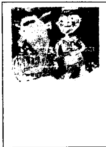
One of the Enikkis by the Grand-Prix Winner of Japan in the 2019-20 Festa.

In Japan we have a custom of creating "Enikki" (Illustrated Diaries) that portray daily events and thoughts in the form of a picture and a short essay. In an "Enikki" the author not only writes about things he/she has seen, heard, done or thought, but also describes his/her rich humanity and sensibility. Since pictures can transcend language and literacy boundaries, "Enikki" can be a very effective means for cross-cultural understanding.